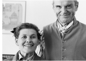
Designers: Charles and Ray Eames